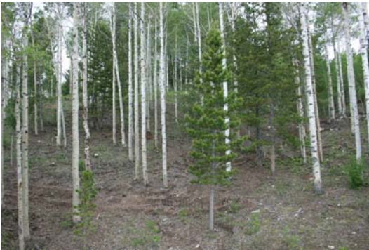
MATURE ASPEN AS SEEN FROM BEDROOM BALCONY