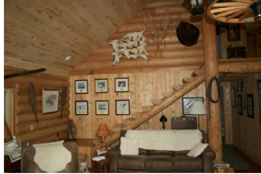
TOP QUALITY CONSTRUCTION