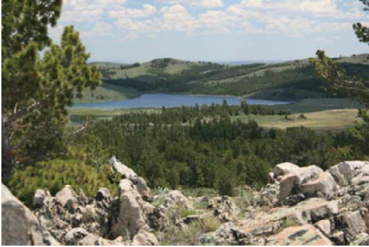
BEAUTIFUL VIEWS FROM ALL ANGLES